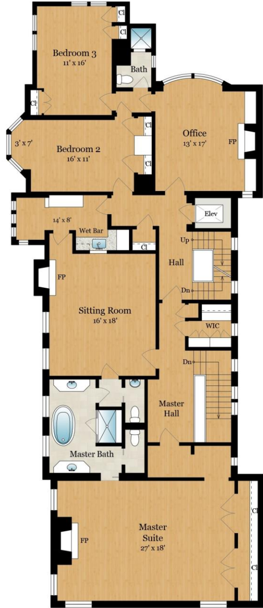
UPPER LEVEL 1 2,695 SQ FT

This information was supplied by Seller and/or other sources. Broker believes this information to be correct but has not verified this information and assumes no legal responsibility for its accuracy. Buyers should investigate these issues to their own satisfaction.