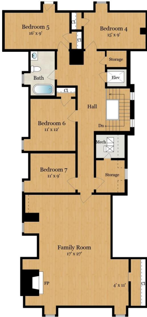
UPPER LEVEL 2 1,825 SQ FT