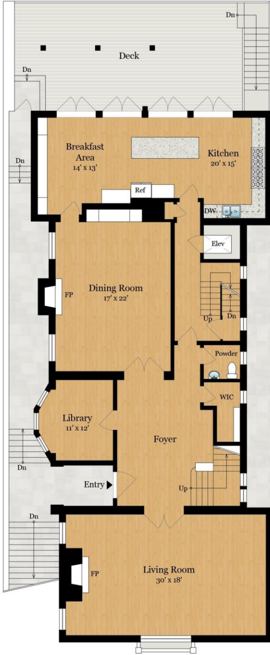
MAIN LEVEL 2,405 SQ FT